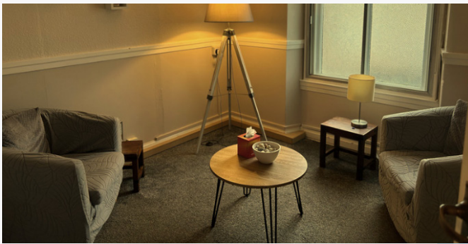
The Star Room

We are part of the Rape Crisis Scotland Network and work within the National Rape Crisis Service standards. We are a Scottish Charitable Incorporated Organisation (SCIO) SC010678.